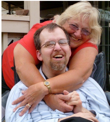
Mom & Son Laughing