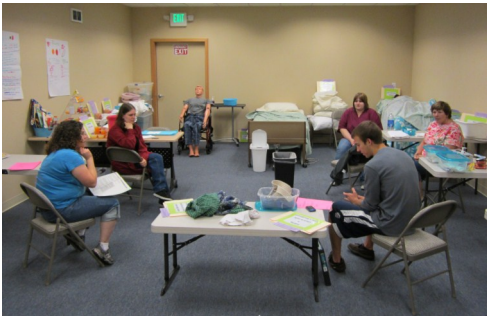
Practice Session in new Training Center