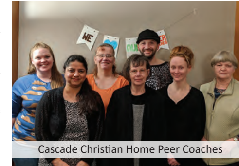
Cascade Christian Home Peer Coaches

Thank you to all our Peer Coaches for your hard work!