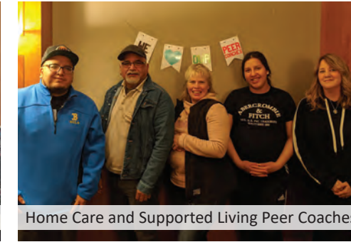
Home Care and Supported Living Peer Coaches