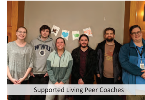
Supported Living Peer Coaches