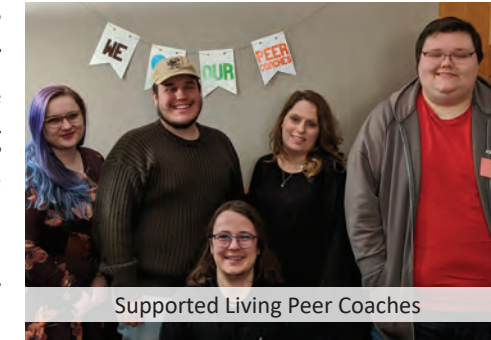
Supported Living Peer Coaches