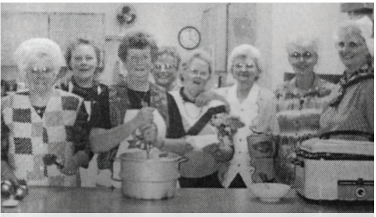
Cascade "Women's Guilds"

We also had many volunteers that helped with maintenance, visiting people, and fundraisers. Many of these people came from local churches that have faithfully supported us for many years. We had a group of community members who formed a Cascade "Women's Guilds". The guild raised much money for different projects like replacing carpeting and providing other necessary items. They raised money to buy the first furnishing in our first home. They held fashion shows and an annual Dutch dinner every year.