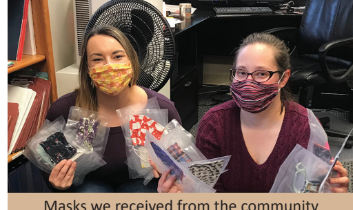
Masks we received from the community organization

were very hard to acquire. However, God has provided all the things that we have needed. A community organization donated 850 masks and we were able to get gloves and soaps from different sources. Staff made disinfectant wipes to be used at our different sites, and Northwest Solutions, Inc. later donated disinfectant spray to us. We truly appreciate all the local businesses who donated these items and community members who continue to serve in whatever way they can as the COVID-19 crisis continues.