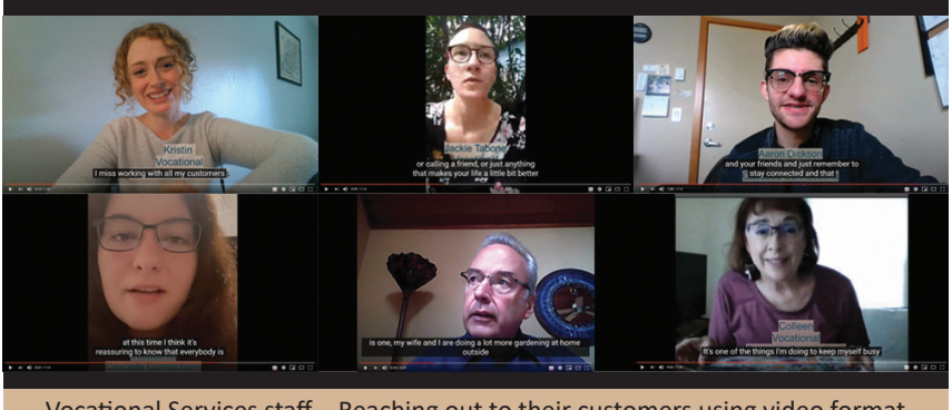
Vocational Services staff – Reaching out to their customers using video format

With a slowed economy, many people did not need respite services, and it looked like we were going to have to furlough people until our hours came back. However, we were blessed by receiving a contract to begin serving seniors with Medicare for the first time.