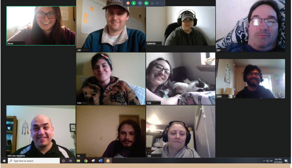
Virtual staff meeting – Cascade Connections Supported Living

We are grateful for our resilient staff. They have been the ones to do the essential shopping and have had to come up with ways to help keep people engaged and connected. The Cascade Christian Home staff has been taking people out for drives, walks, and gardening. Our Supported Living staff has been coming up with creative ways to entertain people, and our Vocational Services staff never missed a beat in connecting with their customers.