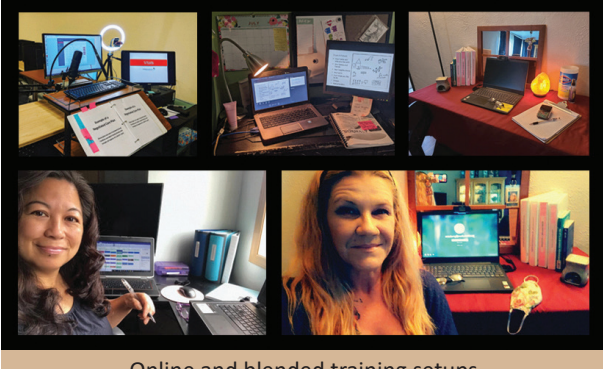
Online and blended training setups

the new technology available. It is our job as leaders in the field of caregiver education to redefine the training method so our clients continue to receive the best care. Thanks to all students, staff, and managers who adapted to the change and the new procedure. We are working to reopen the in-person training program slowly in a safe, secure manner for all students and staff.